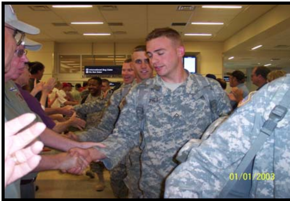
On May 29th, NRW joined with others to greet the arriving troops with thanks, handshakes, smiles and cookies for the road. Please plan to join us at DFW on September 12th to greet more troops.