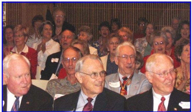
These are the faces of American heroes. They have come to let us honor them on Memorial Day for their service to our country. They came to serve when called upon and we owe them much. The room overflowed with NRW members and Dallas veterans.